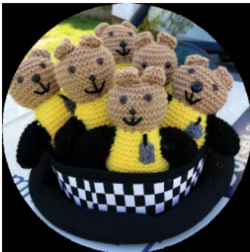
Bobby Buddies teddy bears

If you are affected by anti-social behavior then please report the problem to the police. The local Neighbourhood Team are looking to patrol the areas where ASB is reported.