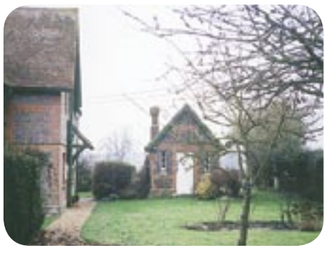
Outbuildings, 5 and 6 Station Road