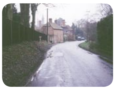
View westward along Rectory Road