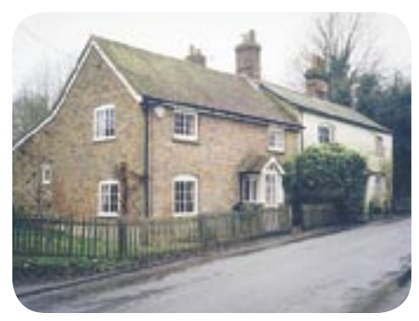
3 and 5 Rectory Road