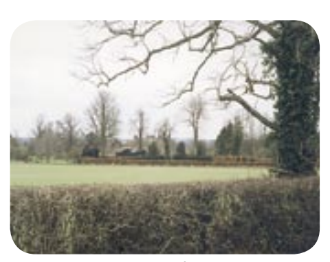
The Manor House from Rectory Road