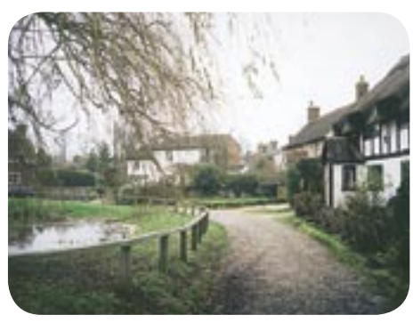
Buildings of significant group value