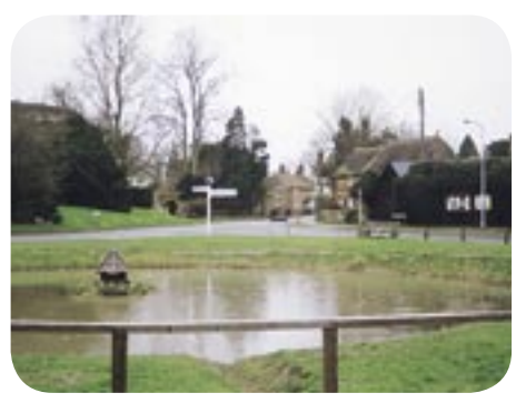
The village pond, East Oakley