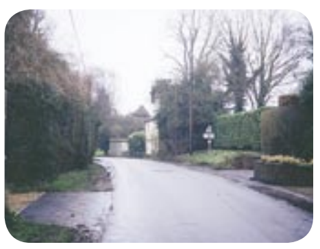
Prominent hip of barn, East Oakley House

Given the domestic scale and simple provincial architecture of the buildings in Oakley, historic joinery (such as sash windows, doors and door hoods) are often the features that define the appearance of properties. Where buildings are in close-knit, continuous street frontages (as along Oakley Lane or around the pond) the relationship of these features and their historic arrangement becomes a significant factor in the overall special character of the area. Although some groups of buildings have been modernised, the use and overall effect of inappropriate replacement windows and doors is limited.