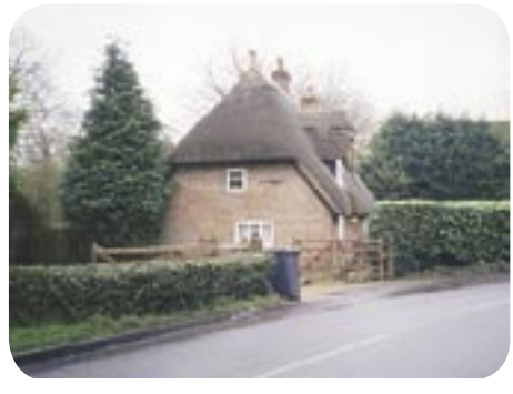
Deepwell Cottage, Oakley Lane

There are several unlisted buildings in the village that contribute to the special character of the Conservation Area. These buildings, dating mainly from the late 18th and 19th centuries, are predominantly constructed of vernacular materials, and are of simple domestic form and scale. Some of these are of historic value by virtue of their social significance, such as the St Leonard's Centre (formerly Church Oakley School). They may also possess features of particular architectural interest. However, it is their group value, in association with adjacent listed buildings, which significantly contributes to the overall special interest of the Conservation Area.