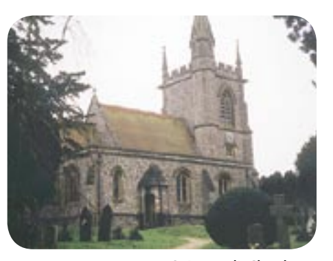
St Leonard's Church