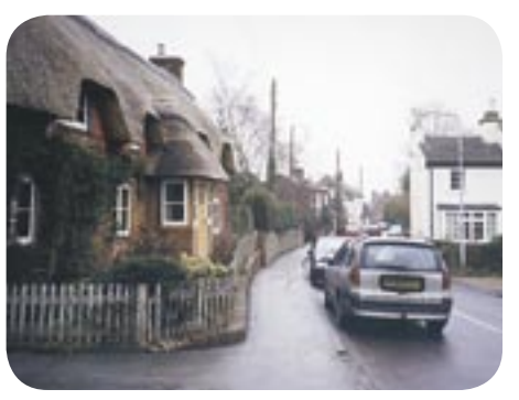
View northwards towards Oakley Lane