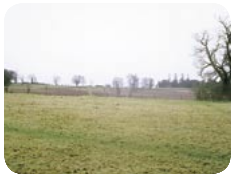
View south from rear of St Leonard's Church