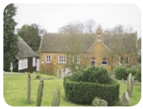
St Leonard's Community Centre (formerly Church Oakley School)

Deepwell Cottage is a timber-framed building with crucks and dates from the 16th century or earlier. The areas of exposed external timber-frame are infilled with brick. The other walling is entirely in Flemish bond with blue headers. Perhaps the most distinctive and prominent feature is the large expanse of thatched roof, emphasised by the low eaves line. Situated at an angle to the curve in Oakley Lane, the hipped north end wall punctuates the view southwards, creating an important setting for the historic environs of the village. Hunters Moon (Nos 4 and 7 Hill Road), a long one and a half-storey thatched cottage (originally a pair) dating from the late 18th century, is of similar individual and townscape merit. Located at the back of the pavement, on a curve in the road, it punctuates significant views into, and out of, the Conservation Area.