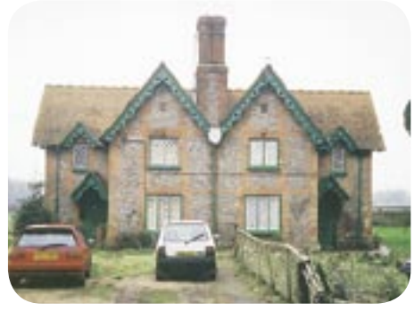
5 and 6 Station Road

The Borough Council provides grants for various types of work. These include, Historic Building Grants, Environment and Regeneration Grants and Village and Community Hall Grants. Leaflets are available explaining the purpose and criteria for each grant and an approach to the Council is recommended for further information on any grant.