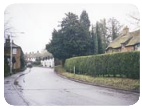
4 and 6 Hill Road from the pond

The special interest of Oakley is characterised by the variety of vernacular building materials and traditions. These include mellow red brick, timber-frame, flint, chalk cob and stone, rendered or painted façades, orange/red roof tiles, slate and thatched roofs. They follow no comprehensive pattern throughout the area. Some timber-framing is evident, particularly on the surviving agricultural structures and Deepwell Cottage. However, brick is the predominant material on most buildings.