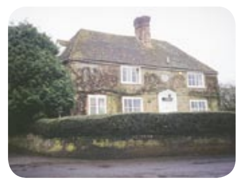
Well House, Rectory Road