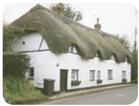
4 and 6 Hill Road