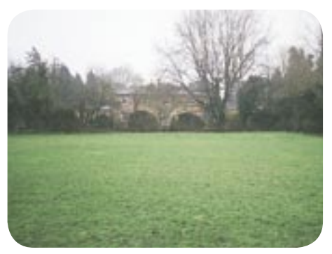
Oakley House (former Rectory)