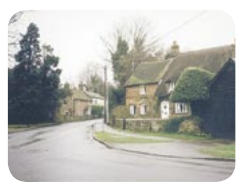
3 Oakley Lane (foreground) and 3 and 5 Rectory Road