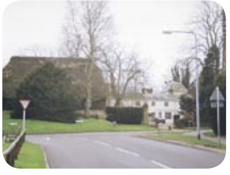
East Oakley House and barn