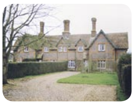
1 to 4 Station Road