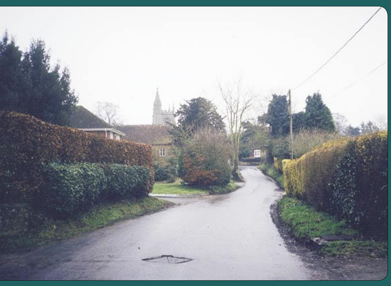
...making a difference