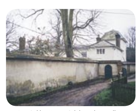
East Oakley House. Cob boundary wall.