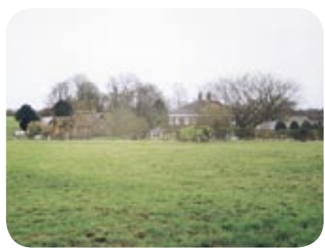
Farmland setting to Station Road