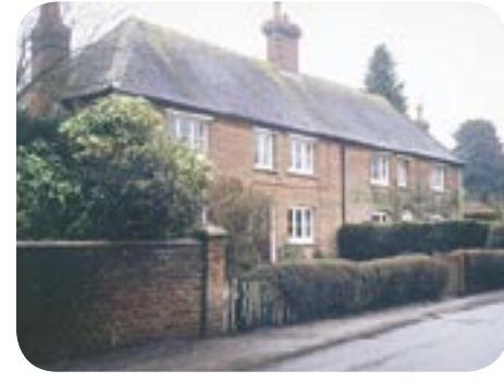
Manor Cottages, Rectory Road

The population of the Conservation Area in 1998 was approximately 167 (projection based on the Hampshire County Council Planning Department Small Area Population Forecasts 1995).